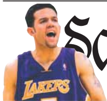
OUT OF COMMISSION SEE PAGE 10